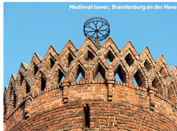
Medieval tower, Brandenburg an der Havel