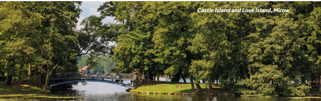
Castle Island and Love Island, Mirow

Recommended restaurant: An der Seepromenade. Amenities: Bakery, butcher, bank.