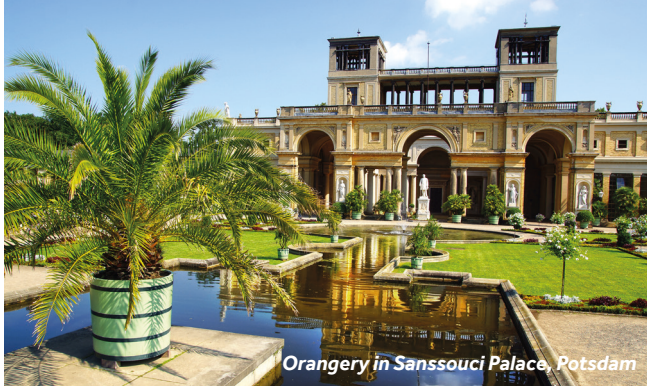
Orangery in Sanssouci Palace, Potsdam