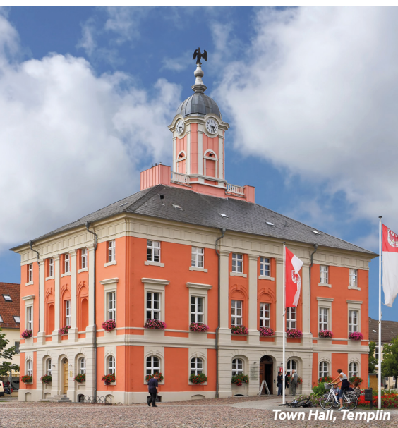
Town Hall, Templin