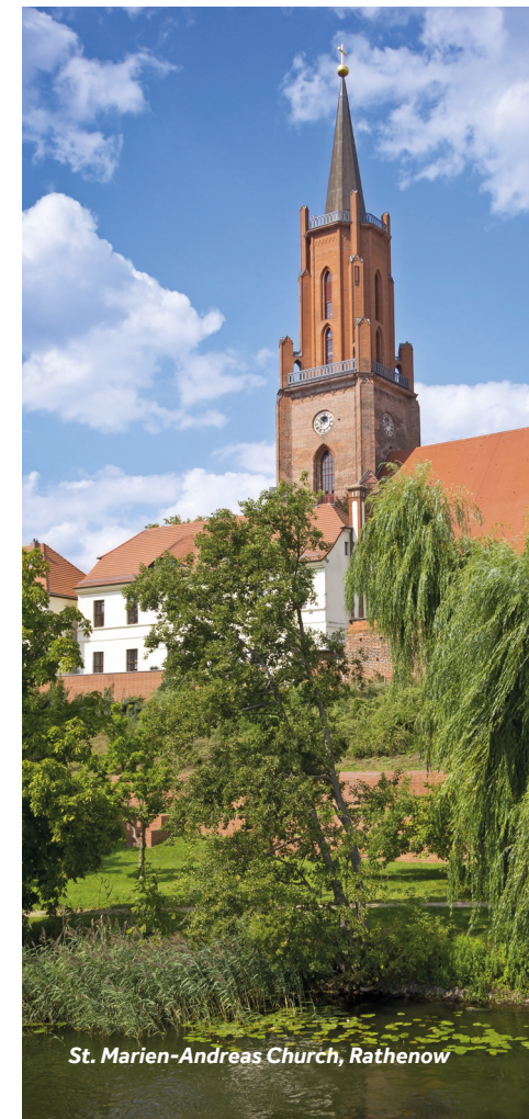
St. Marien-Andreas Church, Rathenow