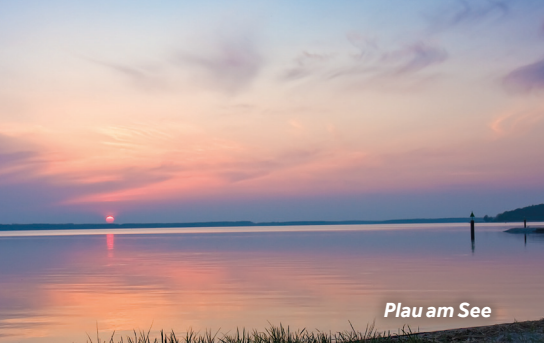
Plau am See