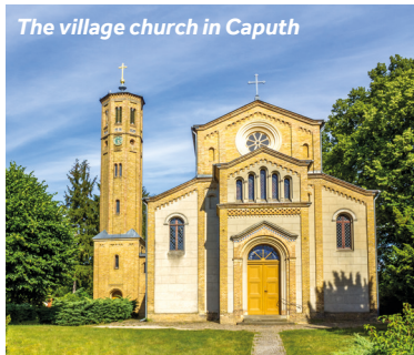
The village church in Caputh

Amenities: A wide variety of shops and restaurants.