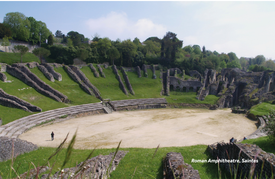
Roman Amphitheatre, Saintes