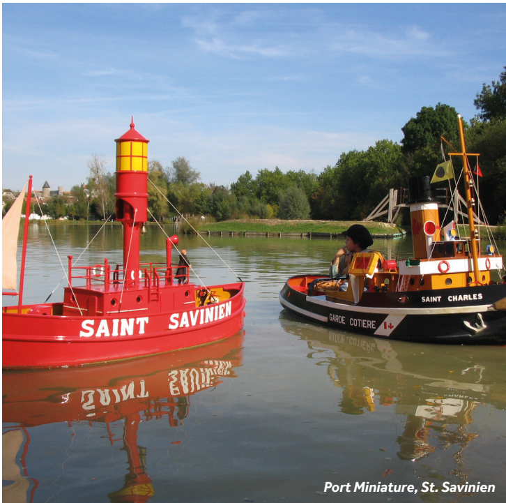
Port Miniature, St. Savinien