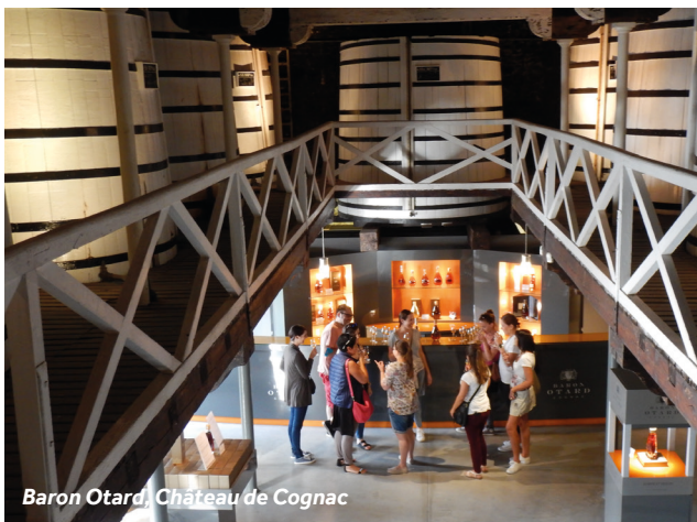
Baron Otard, Château de Cognac

Cognac is known internationally for its Cognac production. The facades and roofs covered with a light black fungus resulting from the evaporation of alcohol into the air, poetically called 'the angels taking their share'. Near the marina, several big Cognac trading houses offer visits and tastings. We recommend a visit and tour around Baron Otard distillery, housed inside the Château de Cognac, where François I was born. Elsewhere in Cognac, discover salt merchants houses, the magnificently renovated Récollets Convent and, nearby, the 12th century church with its Romanesque façade, punctuated with a flamboyant rose, stained-glass window. Visit the excellent tourist office for a variety of ways to explore the town. They have a booklet called 'Laissez-vous conter Cognac' (Discover the world of Cognac) which contains a programme of six visits to attractions, each with its own unique appeal.