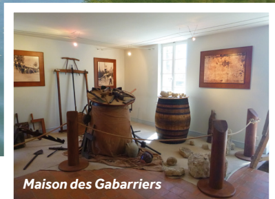
Maison des Gabarriers