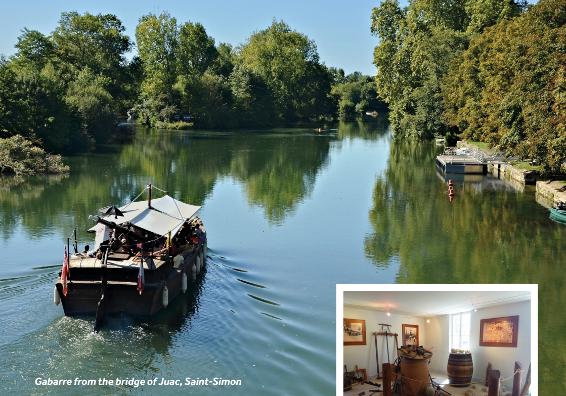
Gabarre from the bridge of Juac, Saint-Simon