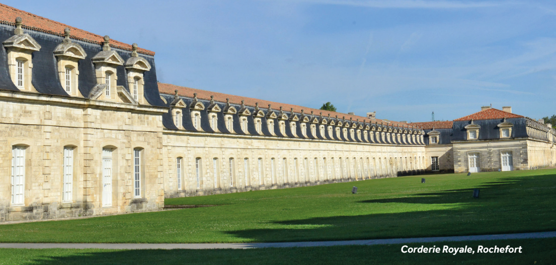
Corderie Royale, Rochefort