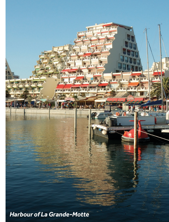
Harbour of La Grande-Motte

Market: Sun (am) and from Jun-Sep also Thu (am) - Place du 1er Octobre 1974.