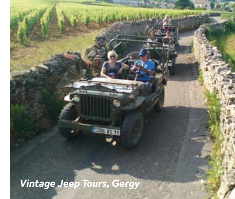
Vintage Jeep Tours, Gergy

Amenities: Small supermarket, bakery, butcher and café.