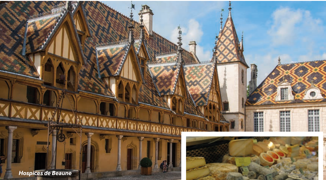
Hospices de Beaune