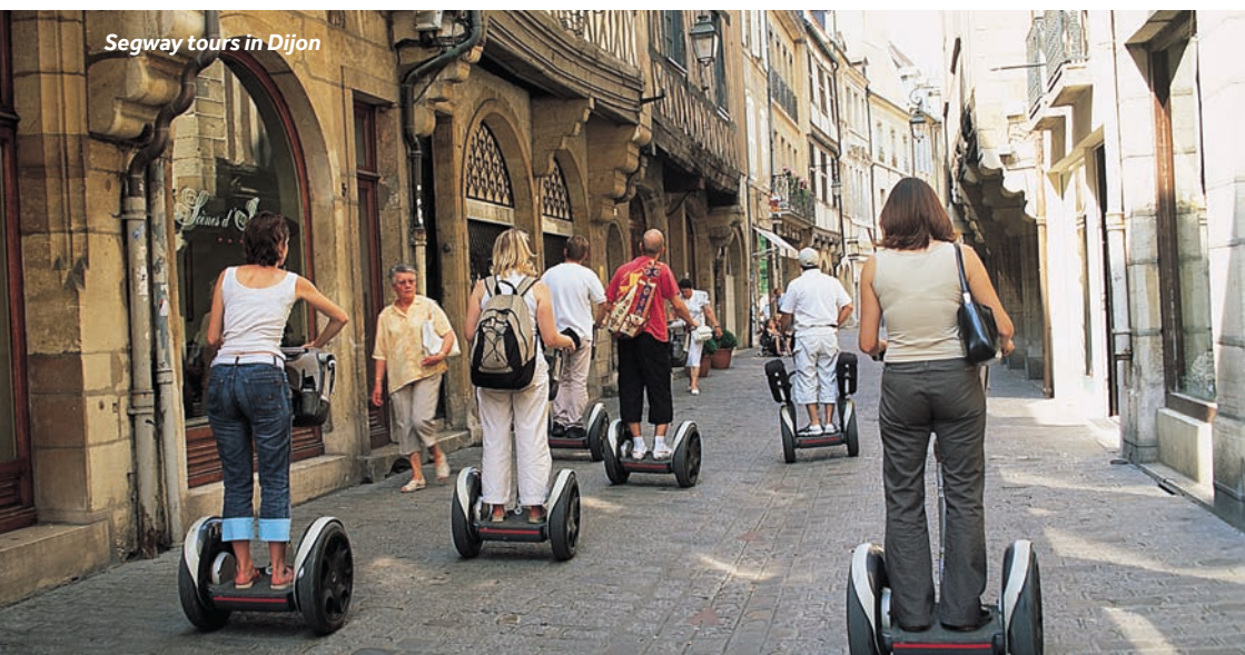
Segway tours in Dijon

Waterside services: The marina here has water, electricity, toilets, showers, launderette, Wi-Fi.