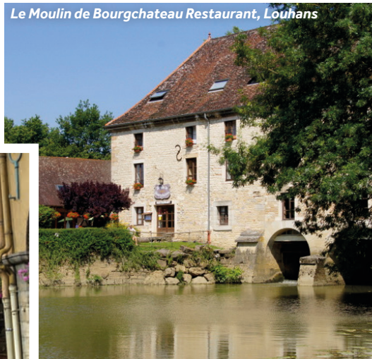
Le Moulin de Bourgchateau Restaurant, Louhans

Waterside services: Port: water, electricity, Wi-Fi.