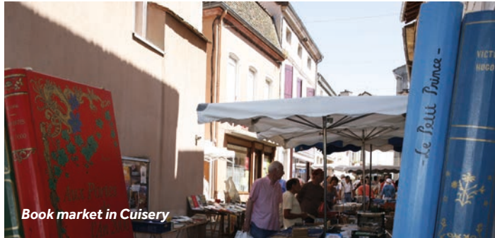
Book market in Cuisery