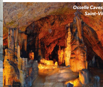
Osselle Caves, Saint-Vit