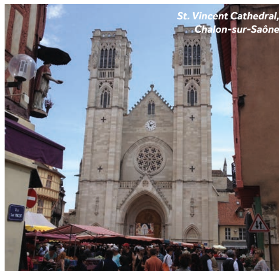
St. Vincent Cathedral, Chalon-sur-Saône