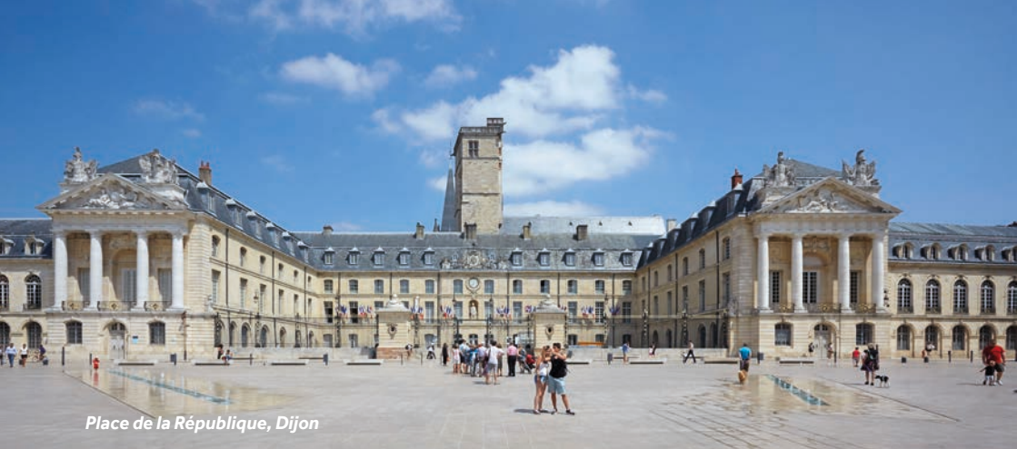
Place de la République, Dijon