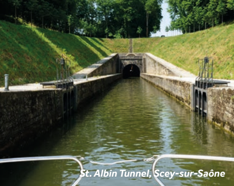
St. Albin Tunnel, Scey-sur-Saône