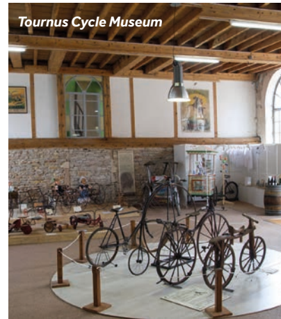
Tournus Cycle Museum

Market: Sat (am) outside the Hospices de Beaune.