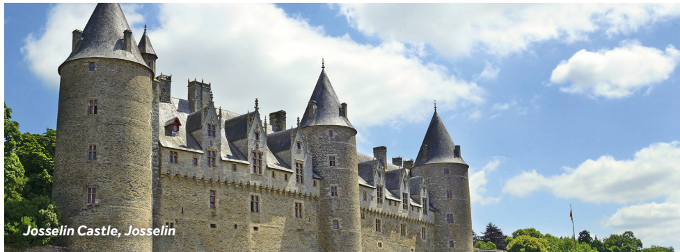
Josselin Castle, Josselin

Waterside facilities: Marina: water, electricity