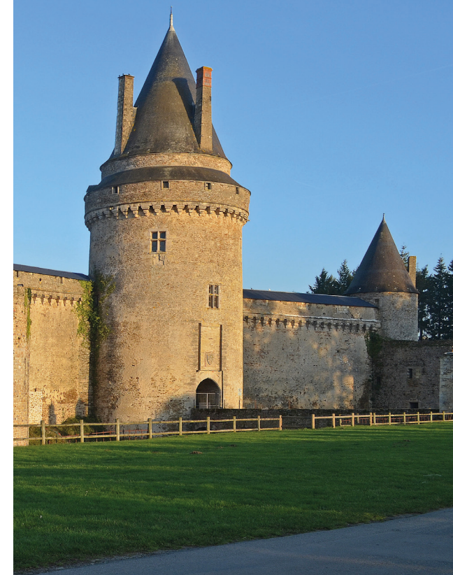
Groulais Castle, Blain