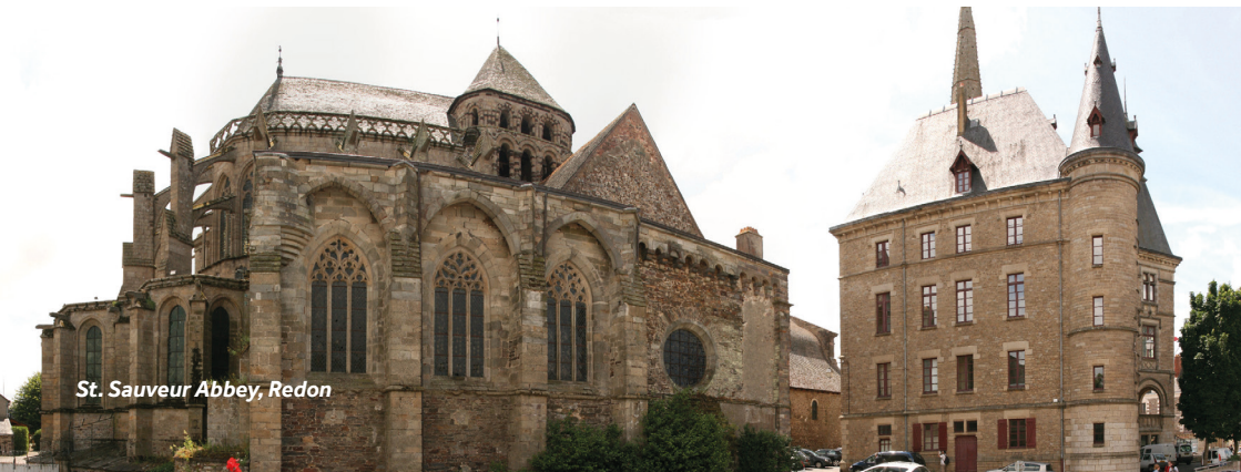
St. Sauveur Abbey, Redon

Waterside facilities: Marina: water, electricity, toilets, showers - fees apply.