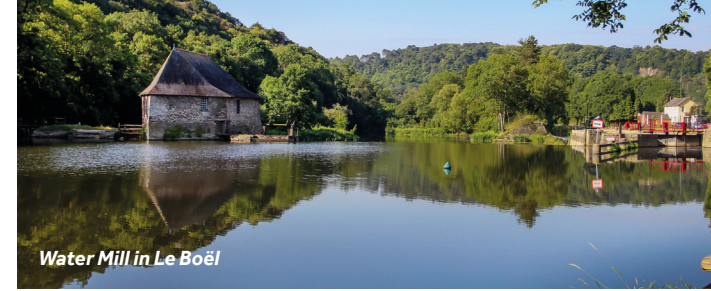
Water Mill in Le Boël

Waterside facilities: Marina: water, electricity, toilets, showers